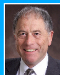
Kurt Wüthrich 2002 - Chemistry