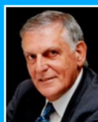
Dan Shechtman 2011 - Chemistry