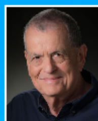
Aaron Ciechanover 2004 - Chemistry