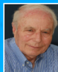
Avram Hershko 2004 - Chemistry