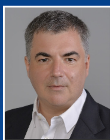
Konstantin Novoselov 2010 - Physics