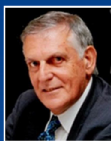
Dan Shechtman 2011 - Chemistry