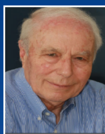
Avram Hershko 2004 - Chemistry