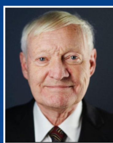
Joachim Frank 2017 - Chemistry