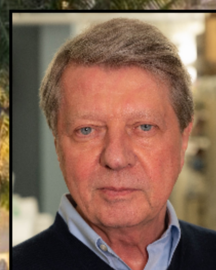
Dr. Krzysztof Matyjaszewski