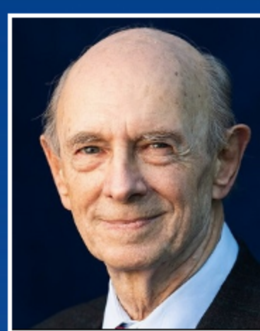
Harvey J. Alter 2020 - Medicine