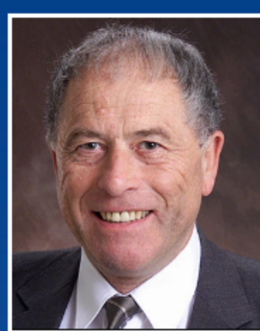
Kurt Wüthrich 2002 - Chemistry