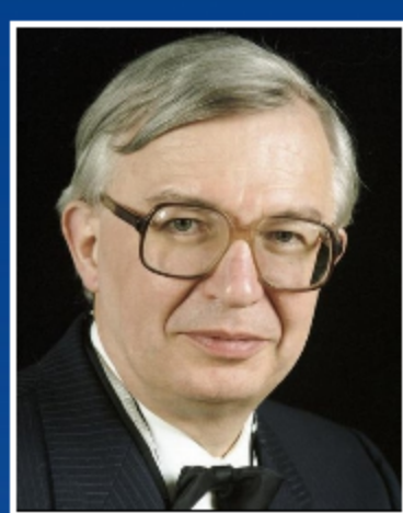
Jean-Marie Lehn 1987 - Chemistry