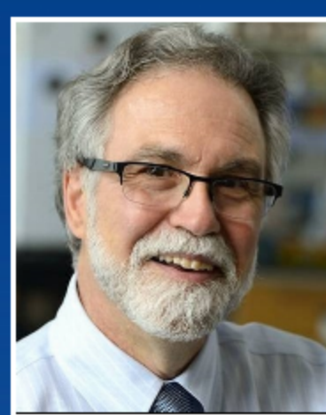
Gregg L. Semenza 2019 - Medicine