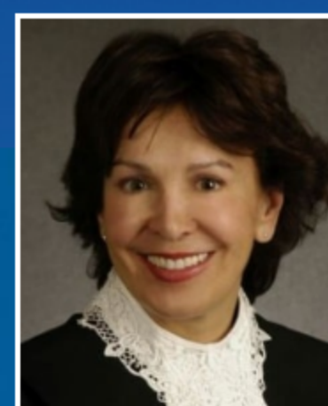
Louise Otis International Judge, Mediator and Arbitrator