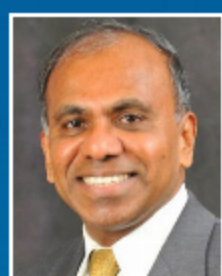
Subra Suresh President, Global Learning Council Switzerland Former Director NSF, USA