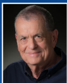
Aaron Ciechanover 2004 - Chemistry