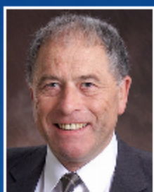
Kurt Wüthrich 2002 - Chemistry