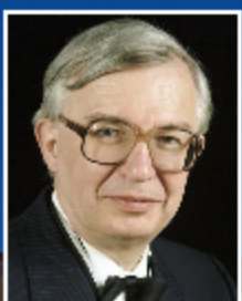
Jean-Marie Lehn 1987 - Chemistry