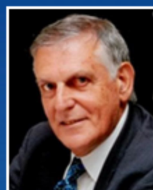
Dan Shechtman 2011 - Chemistry