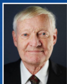
Joachim Frank 2017 - Chemistry