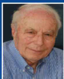
Avram Hershko 2004 - Chemistry