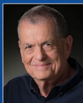
Dr. Aaron Ciechanover

Dedicated in Honor of Nobel Laureate in Chemistry, Prof. Aaron Ciechanover