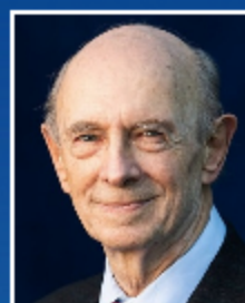
Harvey J. Alter 2020 - Medicine