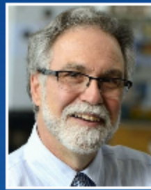
Gregg L. Semenza 2019 - Medicine