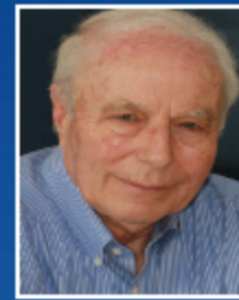
Avram Hershko 2004 - Chemistry