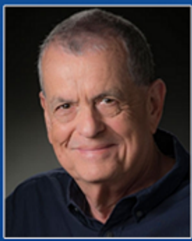
Dr. Aaron Ciechanover

Dedicated in Honor of Nobel Laureate in Chemistry, Prof. Aaron Ciechanover