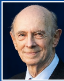
Harvey J. Alter 2020 - Medicine