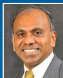
Subra Suresh President, Global Learning Council Switzerland Former Director NSF, USA