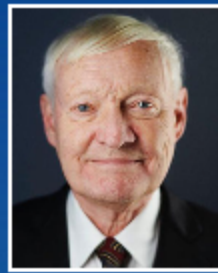
Joachim Frank 2017 - Chemistry