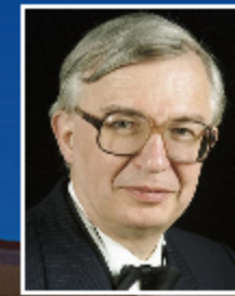
Jean-Marie Lehn 1987 - Chemistry