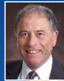
Kurt Wüthrich 2002 - Chemistry