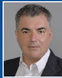
Konstantin Novoselov 2010 - Physics