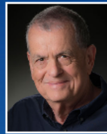
Aaron Ciechanover 2004 - Chemistry