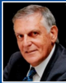
Dan Shechtman 2011 - Chemistry