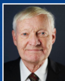
Joachim Frank 2017 - Chemistry