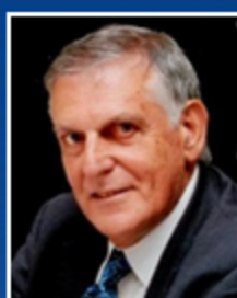
Dan Shechtman 2011 - Chemistry