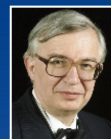
Jean-Marie Lehn 1987 - Chemistry