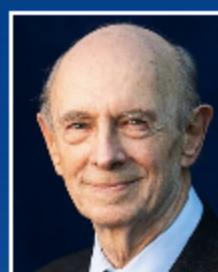
Harvey J. Alter 2020 - Medicine