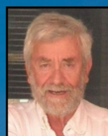
Miguel A. Alario Franco U. of Madrid Spain (Passed away on 26 Aug. 2024)