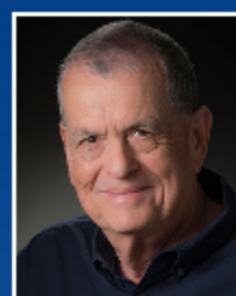
Aaron Ciechanover 2004 - Chemistry