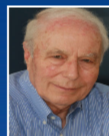
Avram Hershko 2004 - Chemistry