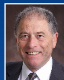
Kurt Wüthrich 2002 - Chemistry