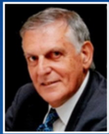
Dan Shechtman 2011 - Chemistry