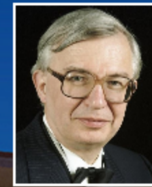
Jean-Marie Lehn 1987 - Chemistry