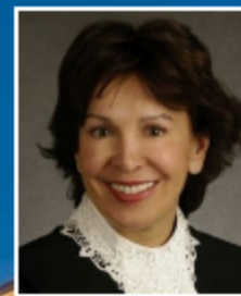
Louise Otis International Judge, Mediator and Arbitrator