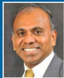
Subra Suresh President, Global Learning Council Switzerland Former Director NSF, USA