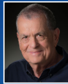
Aaron Ciechanover 2004 - Chemistry