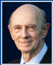
Harvey J. Alter 2020 - Medicine