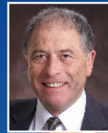
Kurt Wüthrich 2002 - Chemistry