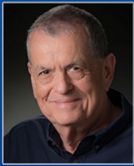
Dr. Aaron Ciechanover

Dedicated in Honor of Nobel Laureate in Chemistry, Prof. Aaron Ciechanover