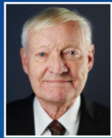
Joachim Frank 2017 - Chemistry