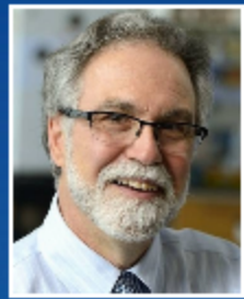
Gregg L. Semenza 2019 - Medicine