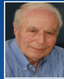
Avram Hershko 2004 - Chemistry