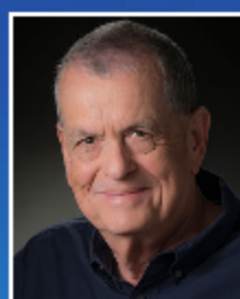
Aaron Ciechanover 2004 - Chemistry