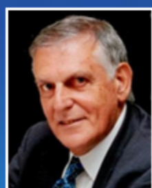
Dan Shechtman 2011 - Chemistry