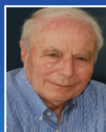
Avram Hershko 2004 - Chemistry