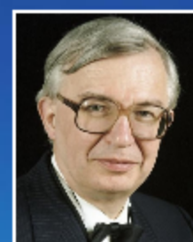
Jean-Marie Lehn 1987 - Chemistry