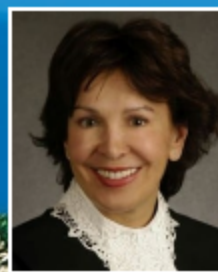
Louise Otis International Judge, Mediator and Arbitrator