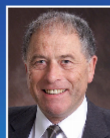
Kurt Wüthrich 2002 - Chemistry