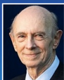
Harvey J. Alter 2020 - Medicine