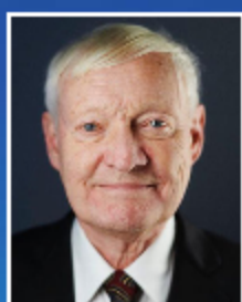
Joachim Frank 2017 - Chemistry