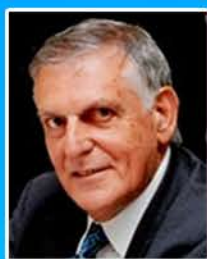
Dan Shechtman 2011 Nobel Prize Winner