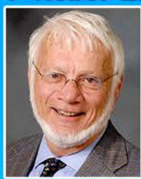
Thomas Steitz 2009 Nobel Prize Winner