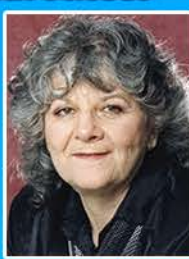
Ada Yonath 2009 Nobel Prize Winner