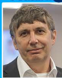
Andre Geim 2010 Nobel Prize Winner