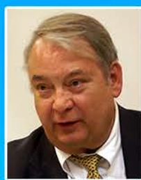
Ferid Murad 1998 Nobel Prize Winner