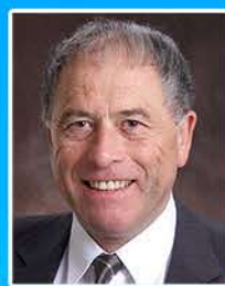
Kurt Wüthrich 2002 Nobel Prize Winner