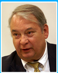
Ferid Murad 1998 Nobel Prize Winner