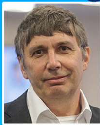
Andre Geim 2010 Nobel Prize Winner