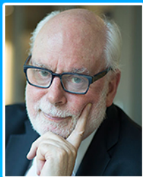
Fraser Stoddart 2016 Nobel Prize Winner