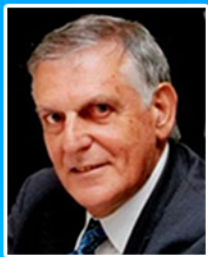
Dan Shechtman 2011 Nobel Prize Winner