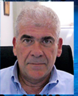
Evangelos Hristoforou National TU Athens