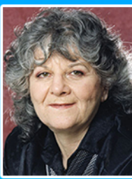
Ada Yonath 2009 Nobel Prize Winner