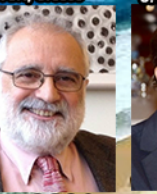
James C. Seferis Polymeric Composite Lab, USA