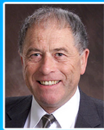
Kurt Wüthrich 2002 Nobel Prize Winner